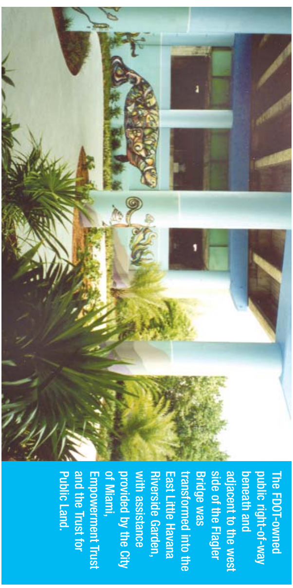
The FDOT-owned public right-of-way beneath and adjacent to the west side of the Flagler Bridge was transformed into the East Little Havana Riverside Garden, with assistance provided by the City of Miami, Empowerment Trust and the Trust for Public Land.

Learn more about the river's history, view records of our meetings, see all our major reports at our web site at www.miami-rivercommission.org , a great resource for what's happening on and near the river.