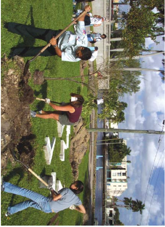
Volunteers from Miami and the Miami River Commission plant trees donated by Carnival Cruise Lines at a pocket park in the historic Grove neighborhood on NW South River Drive and NW 16th Ave.