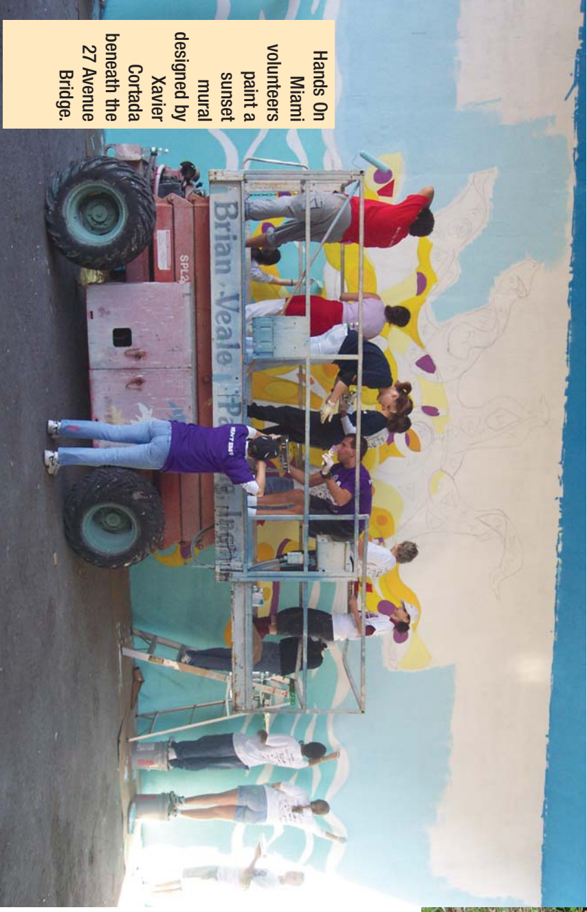
Hands On Miami volunteers paint a sunset mural designed by Xavier Cortada beneath the 27 Avenue Bridge.