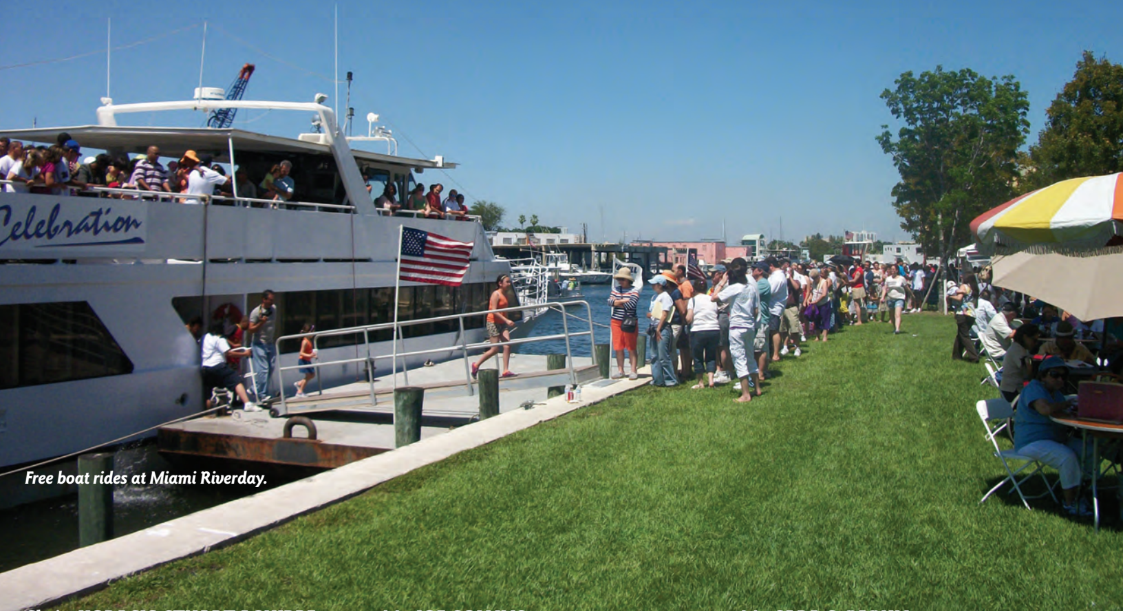
Free boat rides at Miami Riverday.

Learn more about the river's history, view records of our meetings, see all our major reports on our web site at www.miamirivercommission.org a great resource for what's happening on and near the river.