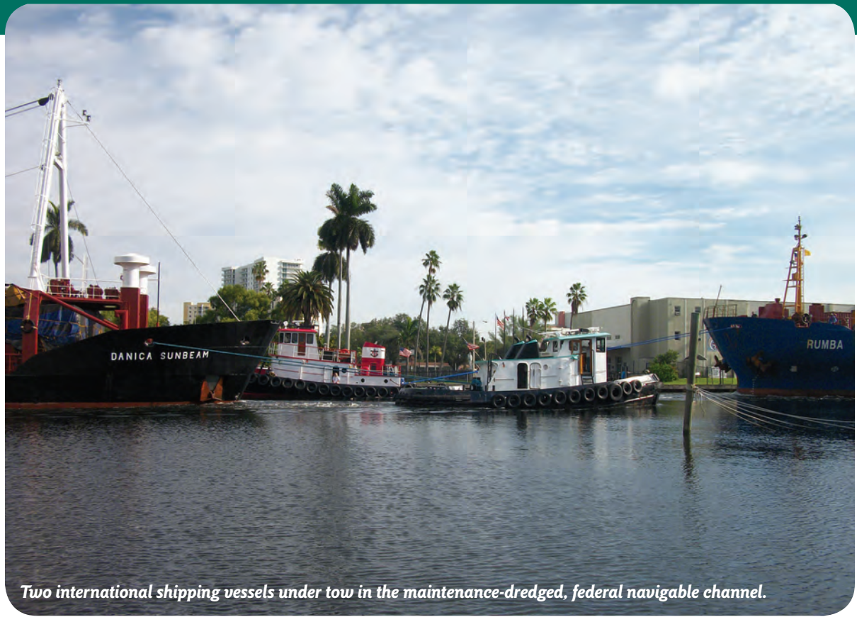
Two international shipping vessels under tow in the maintenance-dredged, federal navigable channel.

and encourages public and parcels to address various are potentially detrimental River, the environmental the River's attraction as a tourists and businesses. Miami River "VIP" assisted the removal of 4 derelict collapsed seawall & dock, dumping, invasive species, all sections of the Miami Commission thanks Miami-mi, FIND, and the private to these recommended