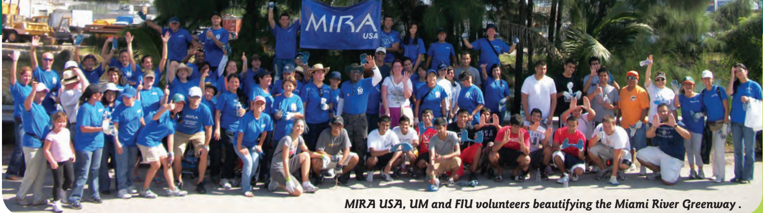
MIRA USA, UM and FIU volunteers beautifying the Miami River Greenway .