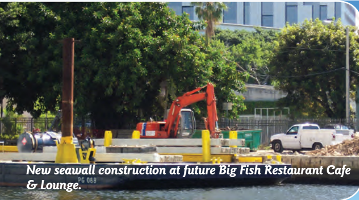
New seawall construction at future Big Fish Restaurant Cafe & Lounge.