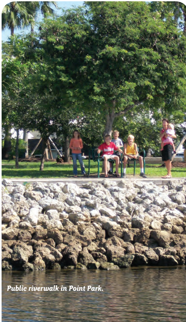
Public riverwalk in Point Park.

For example, the MRC thanks Miami-Dade County for recently restriping NW 17 Ave as it approaches the 17 Ave Bridge, creating an additional northbound vehicular lane, and the private sector will commence a Water Bus service in 2012, both recommendations from the Miami River Corridor Multi-Modal Transportation Plan . Over the past decade, 7,082 new riverfront residential units have been constructed, and another 7,254 units were approved. There are 15 operating riverfront restaurants, and 11 additional restaurant sites are available for operators.