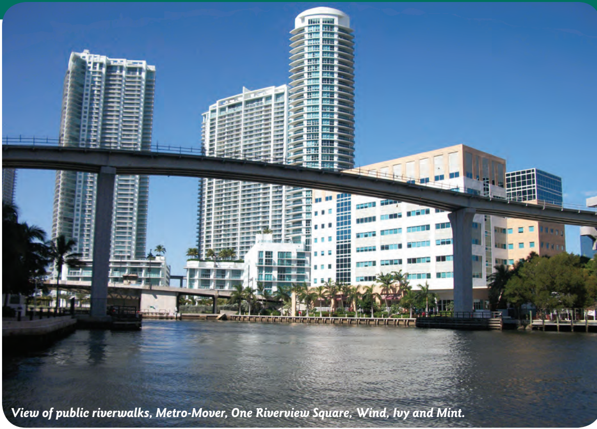
View of public riverwalks, Metro-Mover, One Riverview Square, Wind, Ivy and Mint.