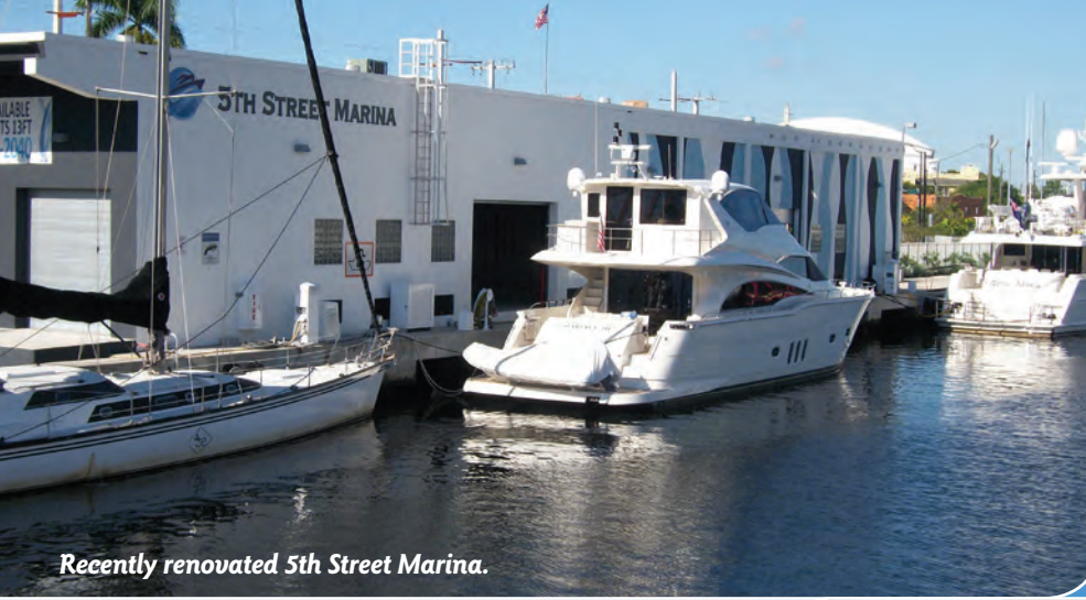
Recently renovated 5th Street Marina.