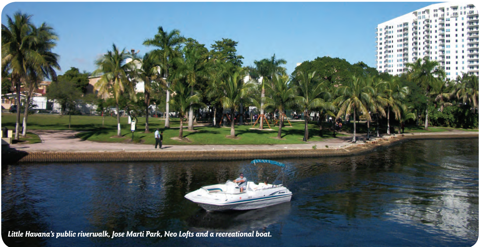
Little Havana’s public riverwalk, Jose Marti Park, Neo Lofts and a recreational boat.