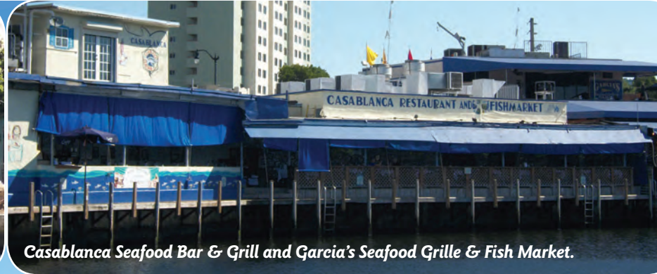
Casablanca Seafood Bar & Grill and Garcia's Seafood Grille & Fish Market.