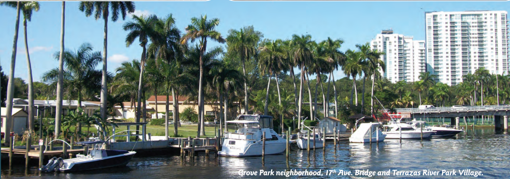
Grove Park neighborhood, 17 th Ave. Bridge and Terrazas River Park Village.