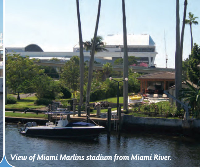
View of Miami Marlins stadium from Miami River.