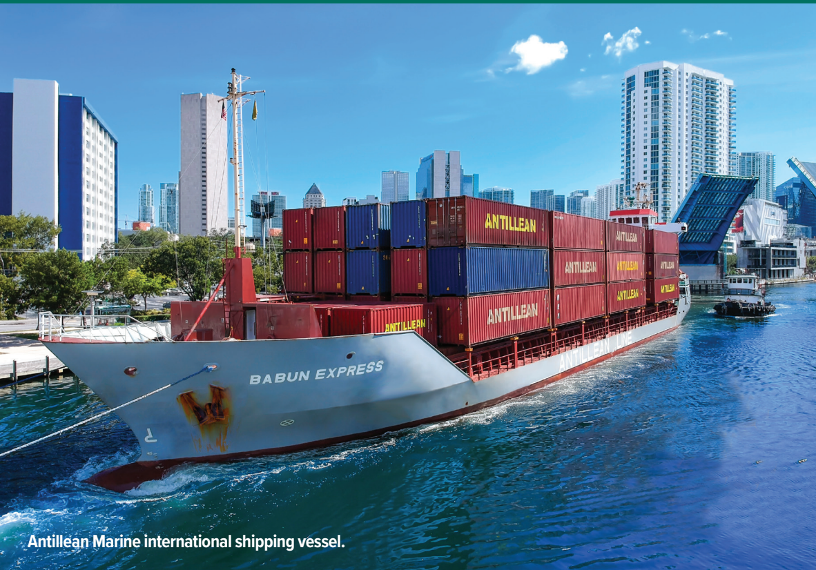
Antillean Marine international shipping vessel.