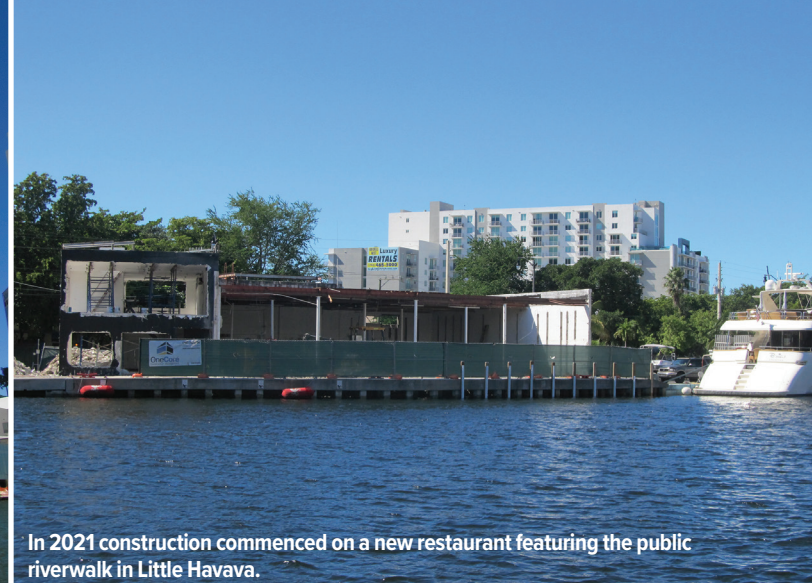
In 2021 construction commenced on a new restaurant featuring the public riverwalk in Little Havana.