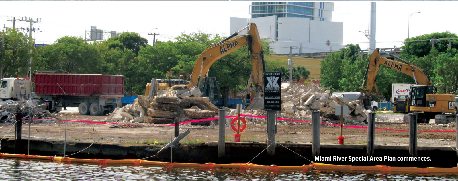
Miami River Special Area Plan commences.