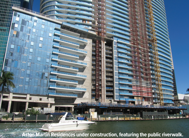
Aston Martin Residences under construction, featuring the public riverwalk.