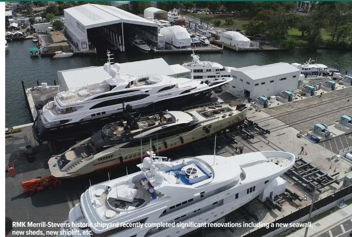
RMK Merrill-Stevens historic shipyard recently completed significant renovations including a new seawall, new sheds, new shiplift, etc.

(VIP) identifies and encourages public and private sector riverfront parcels to address various riverfront issues which are potentially detrimental to operations on the River, the environmental quality of the River, and the River's attraction as a destination for residents, tourists and businesses. In 2021 alone, the Miami River "VIP" resulted in 15 Miami River Greenway Beautification volunteer events featuring plantings, removal of illegal dumping, invasive species, and graffiti along several sections of the Miami River, removing derelict vessels, repairing Riverwalk lights, unclogging stormwater drains, removing a floating hazard to navigation and oil sheen, found and corrected sources of contamination etc. The MRC thanks Miami-Dade County, City of Miami, FIND, FDOT, private sector, and the fantastic volunteers for their hard work bringing these River improvements to fruition.